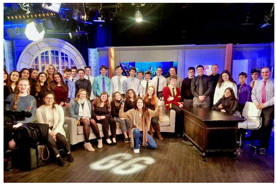
Monsignor Farrell TV Students and St. Joseph Hill TV Students at the Greg Gutfeld Show.