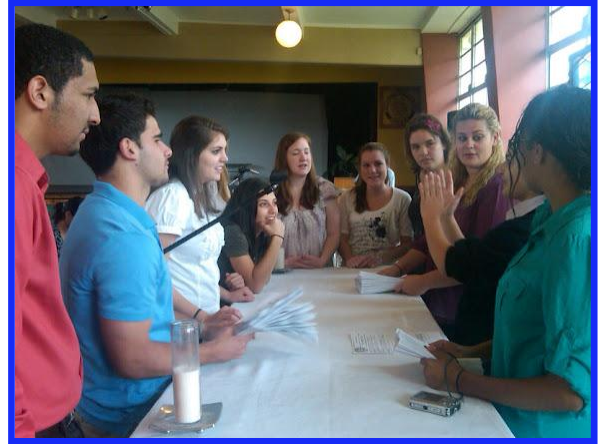
Students from Iona College participate in a variety of activities with students from Archbishop Curley Notre Dame 6 to 12 Prep while visiting Miami as part of their involvement with the Iona In Mission program.

For more information about the role of the Congregation of Christian Brothers at Archbishop Curley Notre Dame 6 to 12 Prep, visit www.acnd.net .